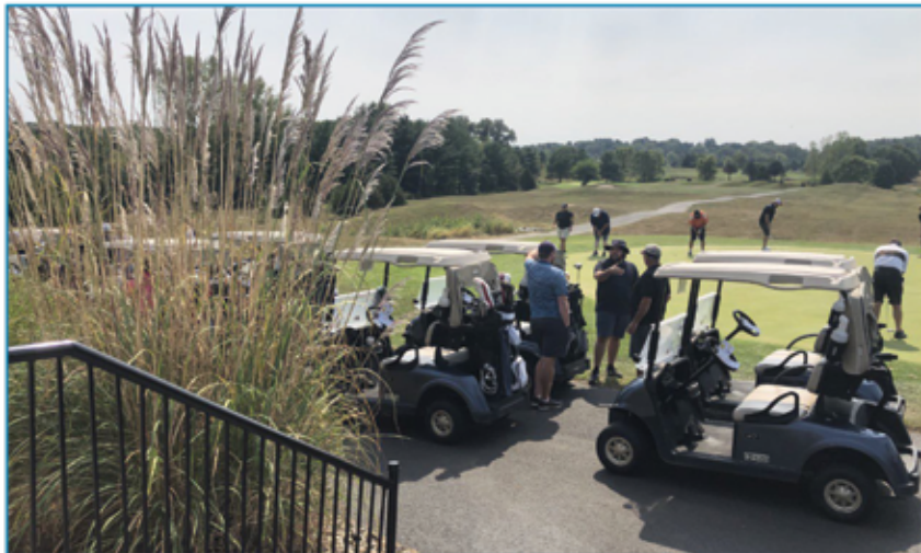
A wonderful view of the beautifully maintained Rolling Meadows Golf Course on tournament day.