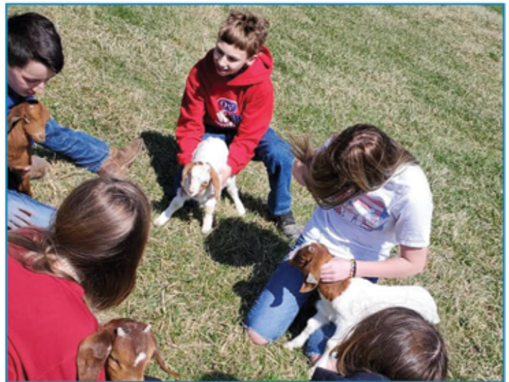
Owen Valley students get the baby goats used to handling at the Owen Valley FFA's goat farm.