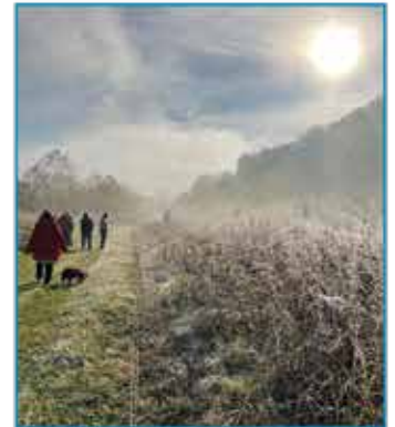
A frosty morning on the MYPATH Trail System.