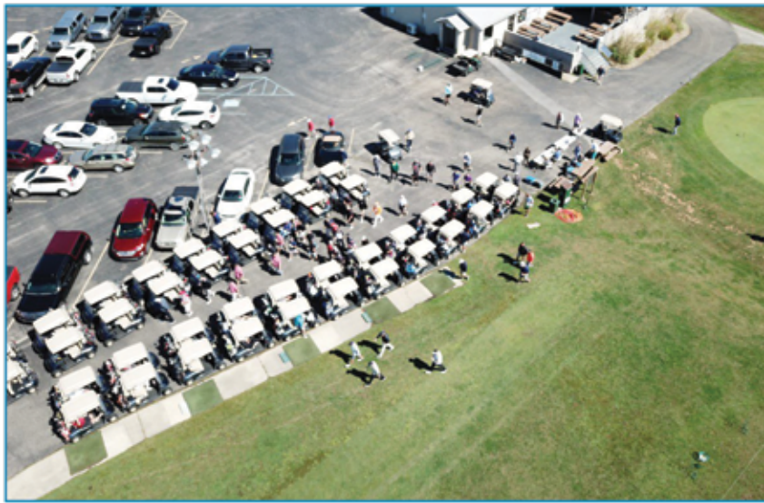
Photographer Darrell White's drone footage of Rolling Meadows.