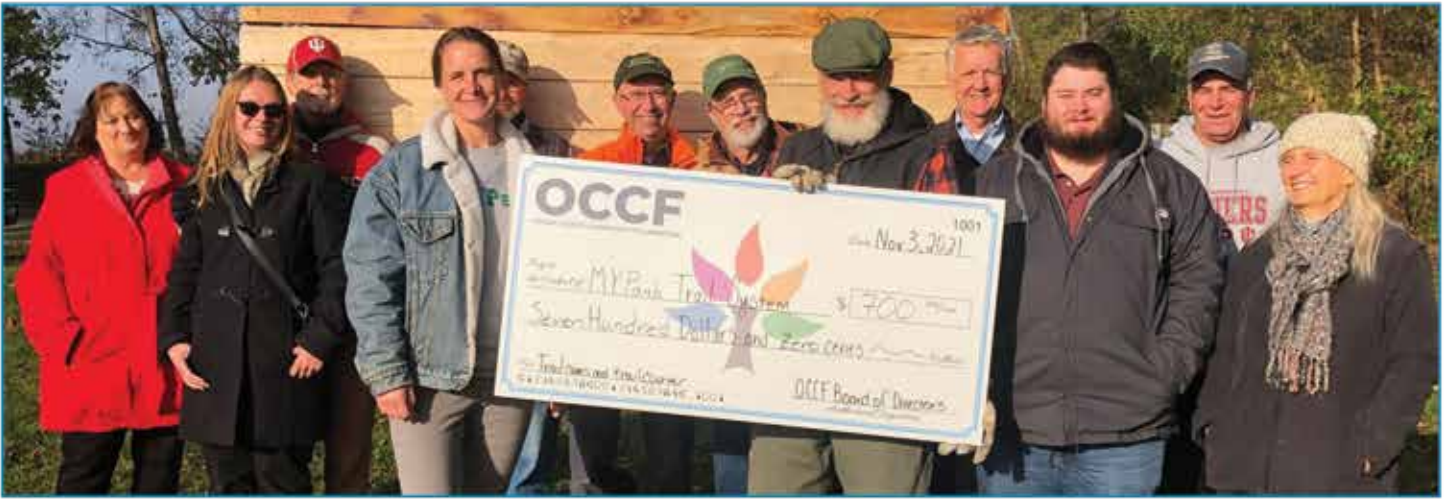
The MYPATH Trail System receives a grant from the Bloomington Board of Realtors' donor-advised fund to purchase trail cameras and a professional pedestrian traffic counter.