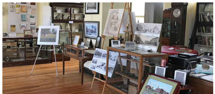
The Owen County Heritage & Cultural Center was one of the many recipients of grants from the Foundation in 2020.

Insurance Services Donor Advised Pass-through grants to Non-profits: The Sanctuary at Browning Farms, South Central CAP, Owen County Chamber of Commerce & Economic Development, Senior Friends of Owen County, Owen Valley Middle School, Presbyterian Church Food Pantry, Owen County Public Library, Owen County Preservations, Inc., Owen County Heritage & Culture Center, Mark of Discipleship Food Pantry, Owen County Public Library, Owen County Preservations, Inc., Owen County Heritage & Culture Ctr, Owen County Humane Society, Spencer Main Street. $8,570 Duke Energy Pass-thru Grant, Main Street Coffee, $5,000 Winners Circle Designs, Class of 2020 yard signs, $1,570