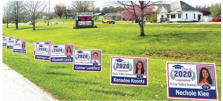
The first of many COVID-19 Recovery Grants: Owen Valley Class of 2020 Senior Signs.

Small Business COVID Economic Recovery Grants supported by The State of Indiana Office of Community and Rural Affairs. Granting $169,500 3 Dimensional Guttering, $5,000 All About You Hair Salon, $5,000 Bell Pyrotechnics Inc, $5,000 Benchmark Builders LLC, $6,000 Chambers Restaurant, $5,000 Cooper Sales & Service, $5,000 Darling Concepts, Inc, $2,000 Diamond K Sweets, $6,000 Elite Electric, $5,000 Emily Jackson Photography, $2,000 Freedom Business Solutions, LLC, $5,000 Gosport Dental Clinic, $5,000 Hometown Services, $5,000 Hoosier Plumbing Service, $5,000 Howling Moon Homestead, $2,500 Interior Restorations, $5,000 Juniper Gallery, $5,000