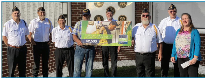
The Coal City American Legion stand in attendance at the check presentation used to purchase a bus for the Honor Guard.