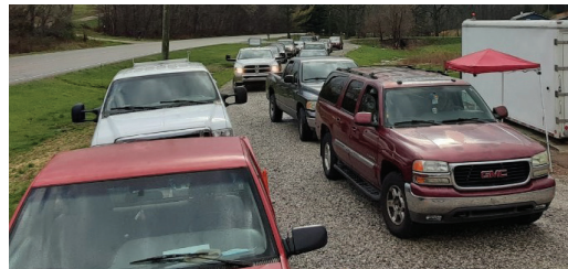
Cars line down the road on the way to the Garrard Chapel Food Pantry.

Our Board of Directors worked proactively to approach the crisis, establishing a fund to provide immediate relief to our nonprofits. This group of community-